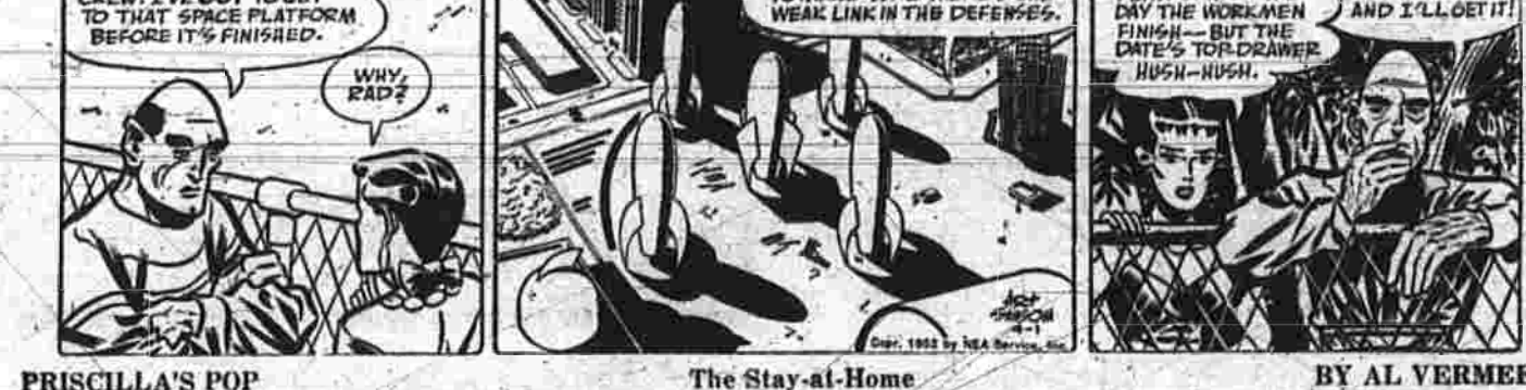
BY RUSS WINTERBOTHAM