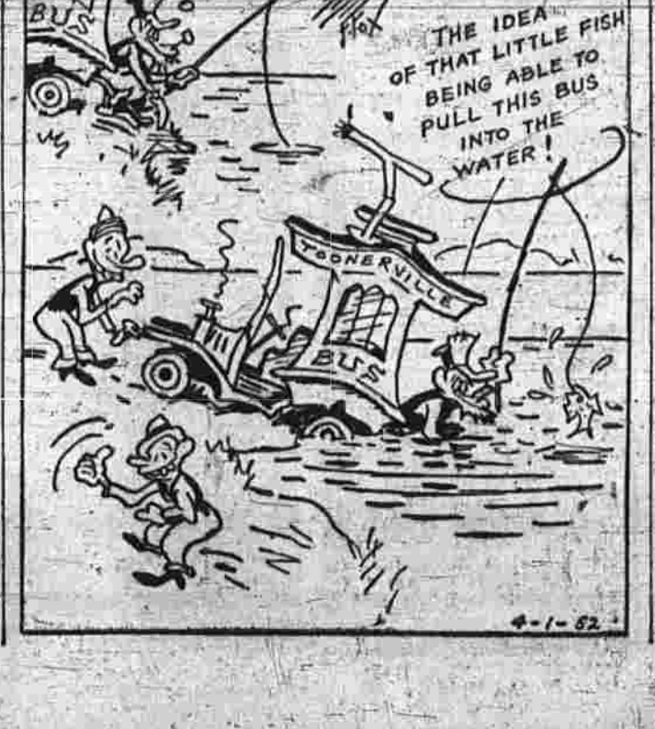
BY FONTAINE FOX