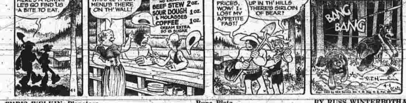
BY V. T. HAMLIN